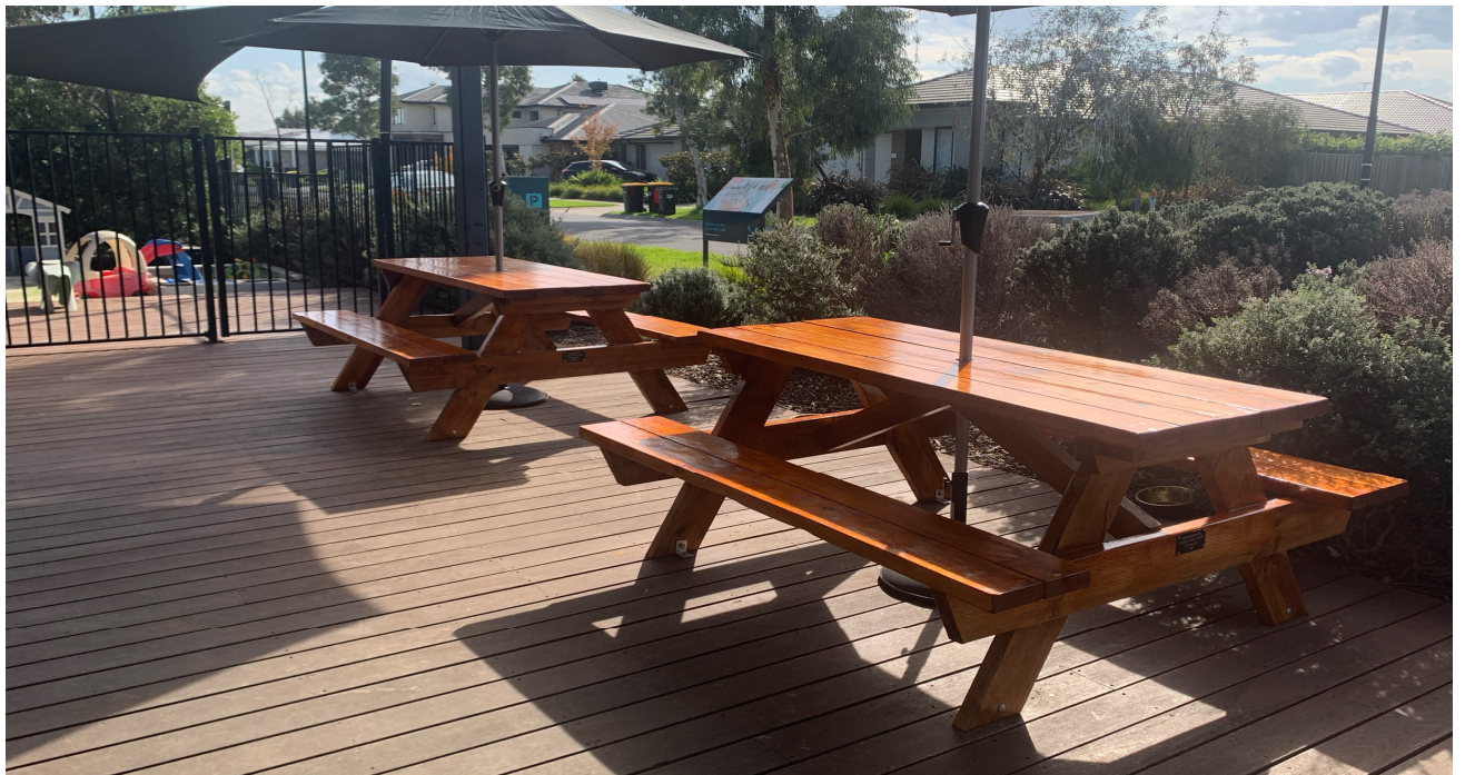
These are the two benches we made for the Grove Cafe in Diggers Rest