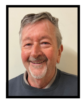
General Committee Stephen King