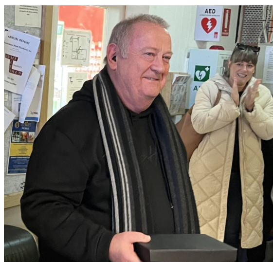
Our Newest Life Member