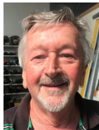
Committee Stephen King