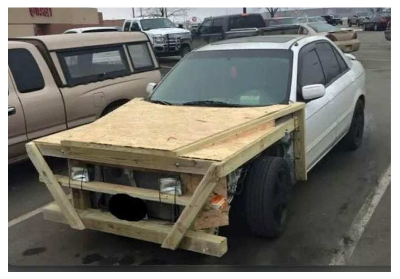
When your dad is a carpenter and you need some car body work