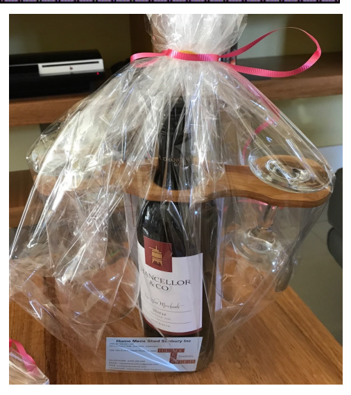
The story that goes with these photos is on page 2