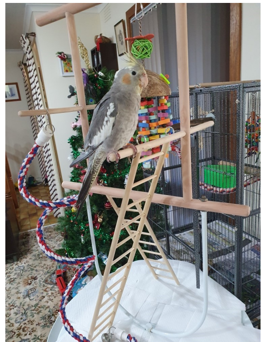
The Coackatiel enjoying his workout equipment