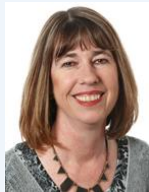
Cr Anne Potter, and Deputy Mayor