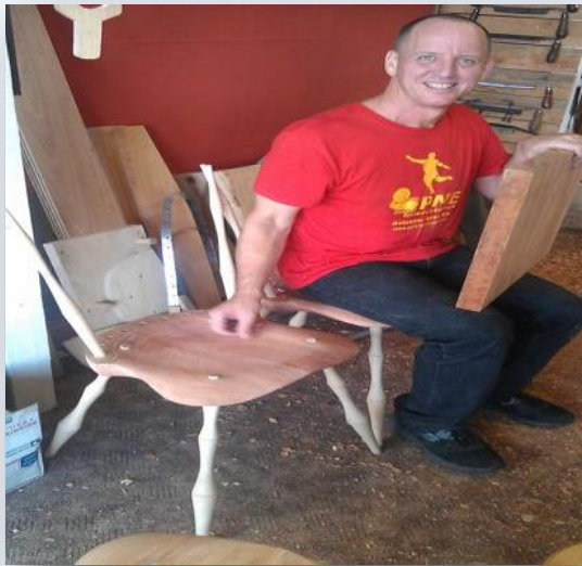
Ready for glue