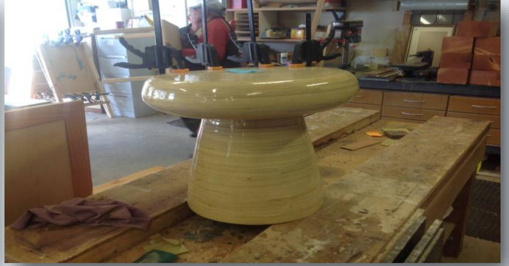
Pot needing repair ... the right glues do the job