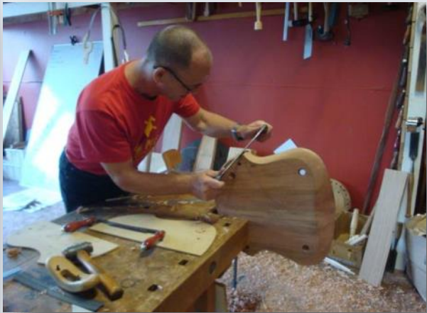
Carving seat detail