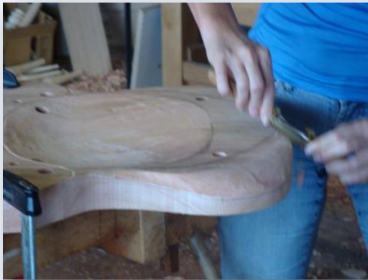
Hand shaping seat profile