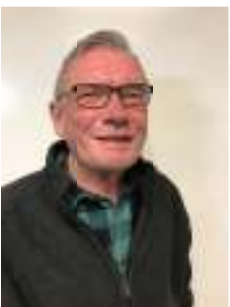
Committee Past President