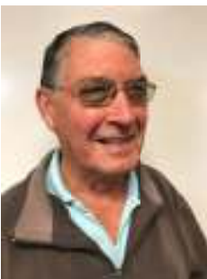
Committee Past President