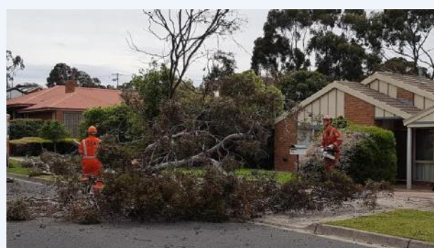
SES members at work