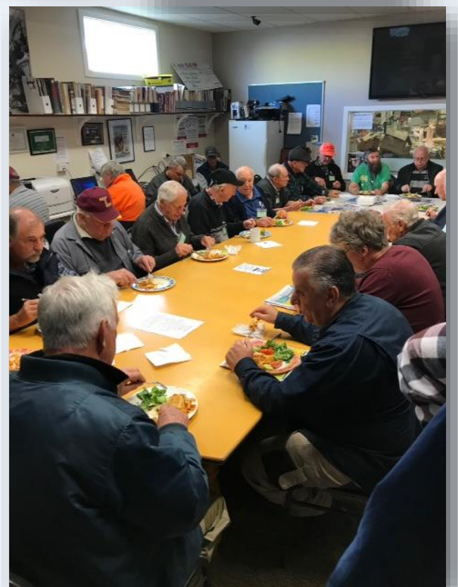
We all chip in to make it a success