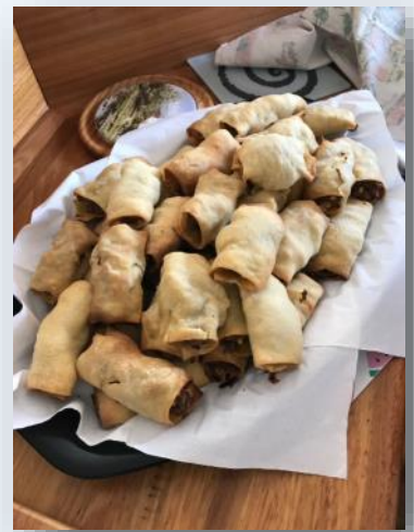
Variety is the spice of life