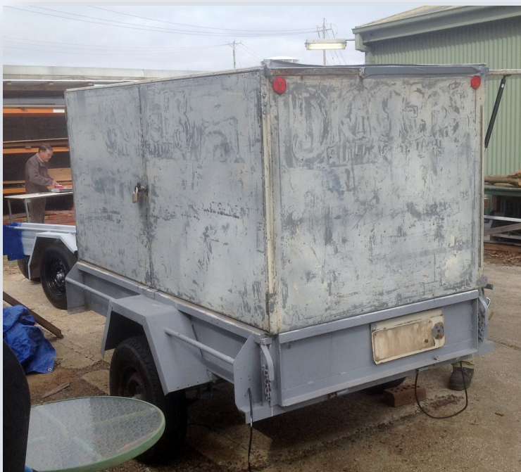
Kevin's pride and joy..his Shed Barbecue Trailer screaming out for some paint and signage. 6 months of toil.